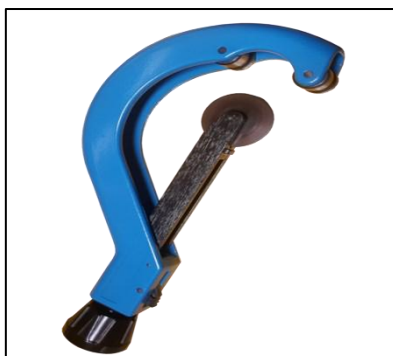
Steel pipe cutter