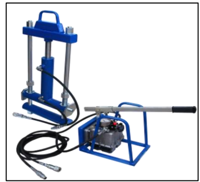
Hydraulic clamp for pipes