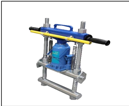
Hydraulic clamp for HDPE