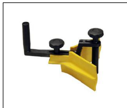
Beveller for pipes