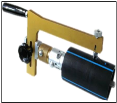
Oxide layer removing device